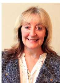
Ruby McKay Chalmers Music School